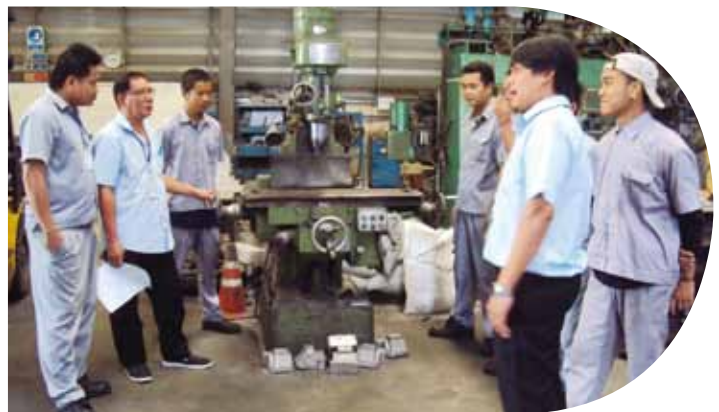
● 模具研發和檢討改進與學習 Learning