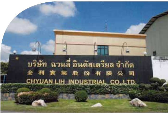
● 公司大門全景 Company outlook