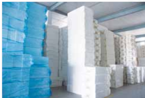
● 產品 Product