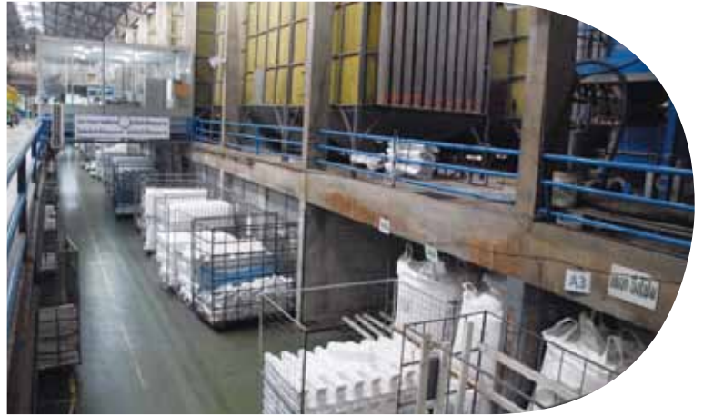
● 生產線 Production Line

全利實業創建於1989年，為泰國地區最具規模之保麗龍(泡沫聚苯乙烯)製造商及經銷商，主要從事保麗龍EPS 相關產品之生產製造。