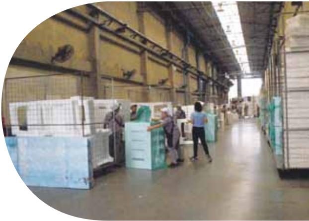
● 生產線 Production Line

ChuanLi Industrial Co., Ltd. was founded in 1989, it is the largest manufacturer and distributor of Styrofoam (Polystyrene foam) in Thailand, primarily engaged in the production of Expanded Polystyrene (EPS) related products.