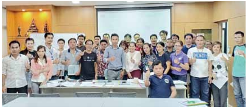
● 經營團隊 Management Team

全利實業自創立以來一直秉持著股東、廠商、客戶及員工皆共榮互利之精神在經營公司，因此以股東利益為先、以顧客為尊，與供