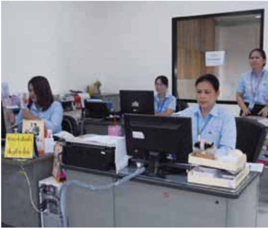
● 辦公室一隅 Office