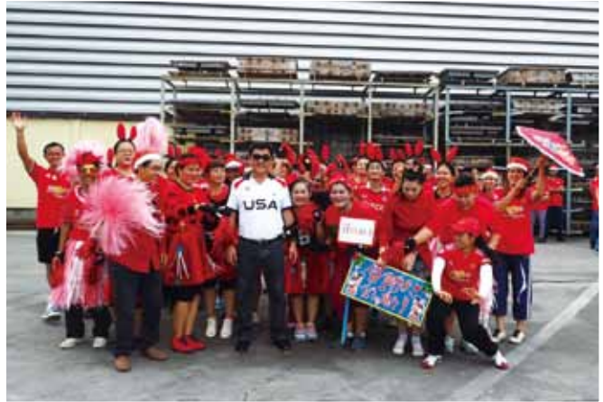
● 尾牙活動和員工運動會 Activities

Advancing towards western and southern markets, the first overseas factory was established in Thailand in 1989 as Chuan Li Industrial Co., Ltd. Soon after, the company further expanded its reach by establishing Mingjia Plastic Foam Packaging Co., Ltd. in Jiading, Shanghai in 1992; then Chia Pao Industry Co., Ltd., in Huiyang, Guangdong Province